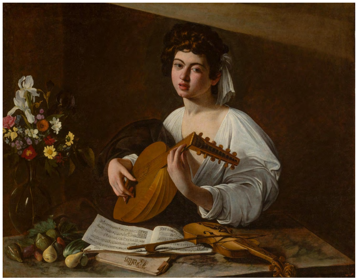
The Lute Player, 1596-7, oil on canvas, Hermitage