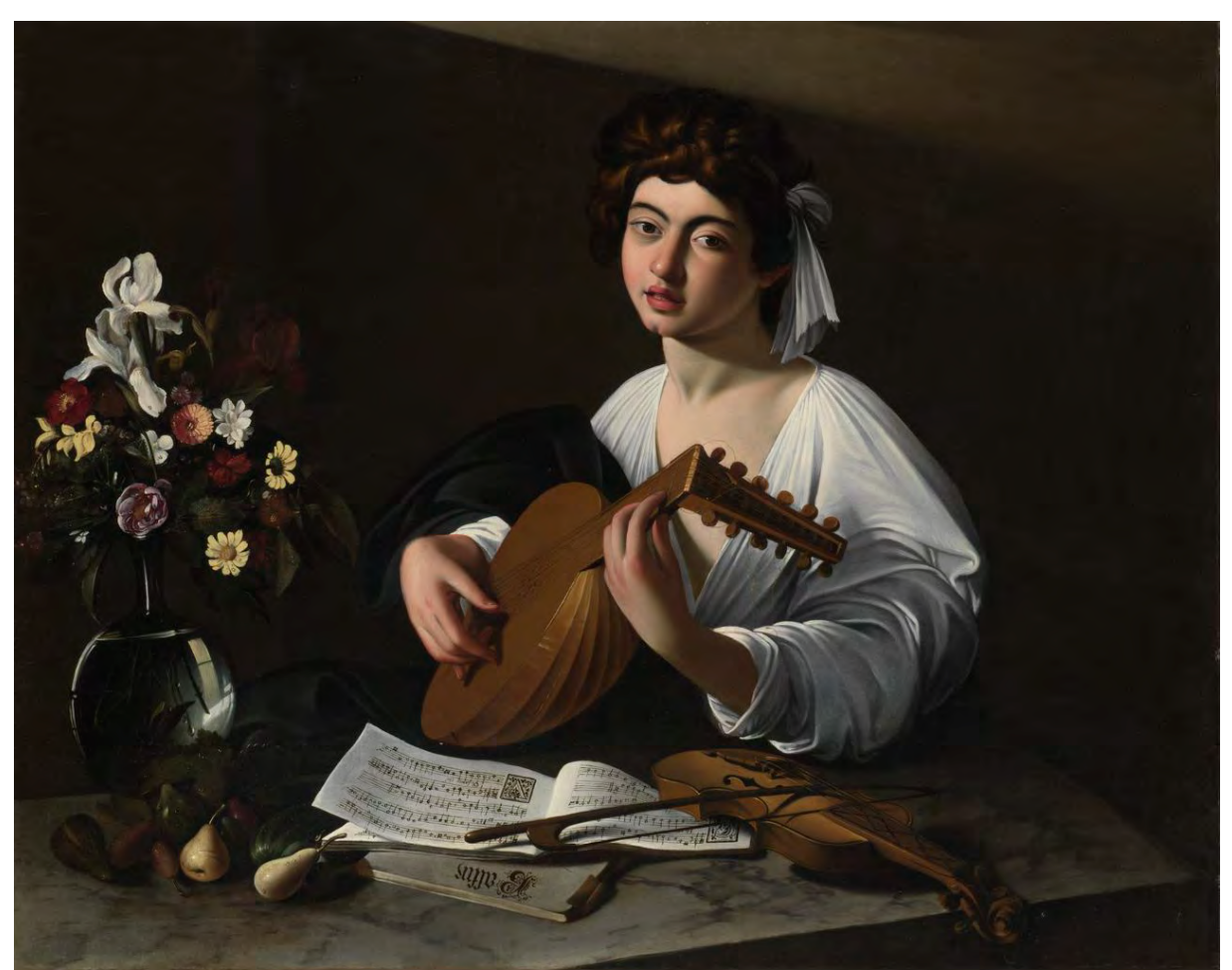
Apollo the Lute Player, 1596-7, oil on canvas, Badminton House Version, Private