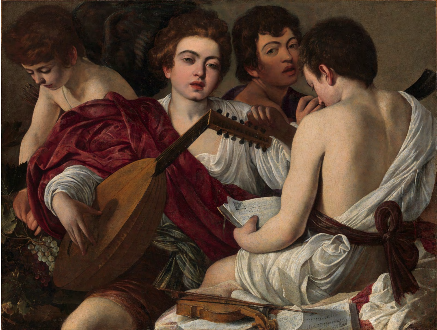
The Musicians, 1597, oil on canvas, Metropolitan, New York

work was not yet that well known, these interested parties remained keen to commission works; in other words, the Cardinal did not enjoy a monopoly of his attention.