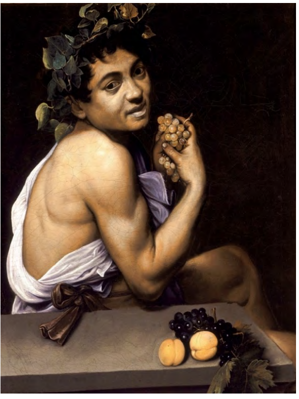
Sick Bacchus, 1596, oil on canvas, Borghese.