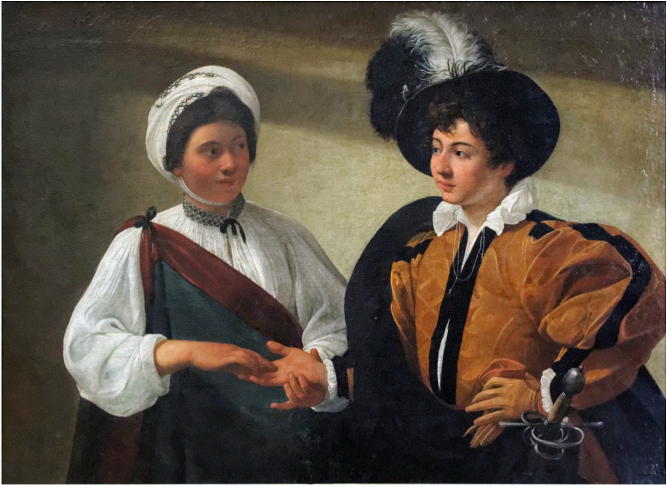
The Fortune Teller, 1596, oil on canvas, Louvre

efforts were resented by other painters. However, it was eventually through the dealer, Constantino Spada, that Caravaggio attracted the attention of Cardinal del Monte.