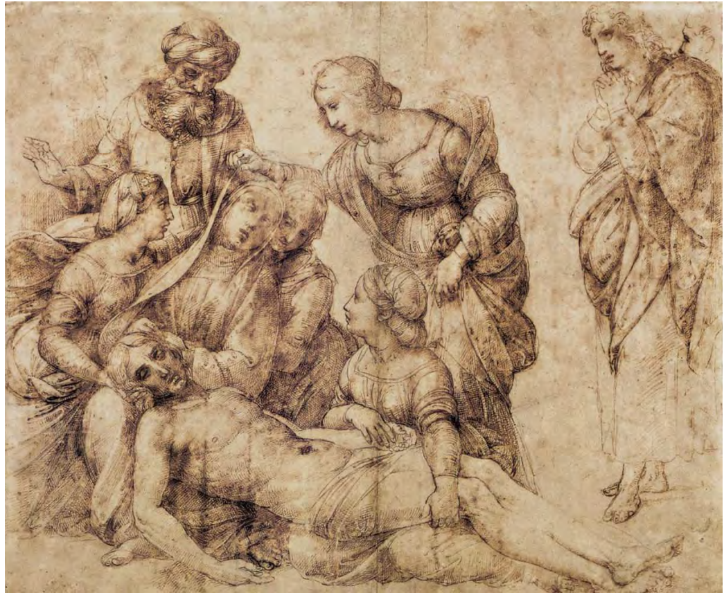
The Lamentation, 1505, Raphael, pen, ink and black chalk, Louvre

This is perhaps an apposite moment to discuss briefly the part played by optics in the work of Caravaggio. In Secret Knowledge , David Hockney devotes a significant amount of effort in persuasively theorising on the degree to which Caravaggio employed optics, specifically a combination of mirrors and lenses. Caravaggio's was a comprehensive change in perception, which can only be explained by a moment of divine inspiration, a Eureka moment. In other words, a way of representing reality by directly transferring a projected image onto a canvas, without all the previously regarded essentials of Classical picture-making.