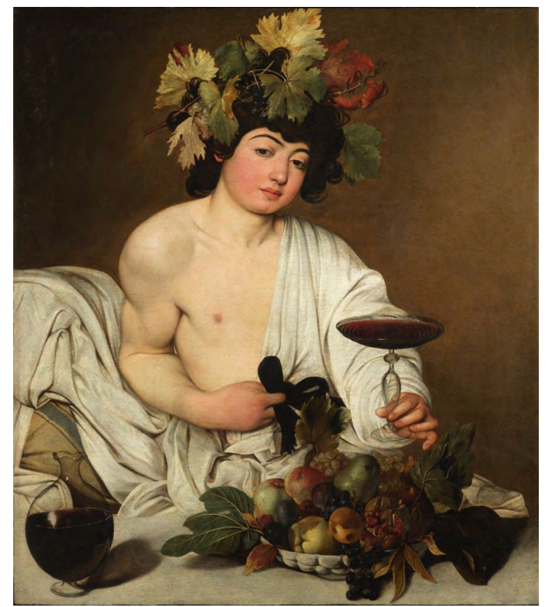
Bacchus, 1597, oil on canvas, Uffizi.

On his head Bacchus is wearing a crown of vine leaves and bunches of grapes as befits the God of Wine and in his left hand he holds a glass of wine by the bottom of the stem, as if captured in the act of offering it to the viewer (viewed in person, ripples are depicted in the meniscus, indicating the movement of the arm). In front, on the stone-table is a ceramic bowl of fruit, apples, pears, grapes, apricots and a pomegranate, some with blemishes, whilst some is frankly rotten. As already highlighted with The Basket of Fruit , such images are regarded as vanitas symbols, symbolic of the transitory nature of life and the worthlessness of worldly goods. To the right of the figure is a decanter of wine, whose shadow is faithfully depicted on the surface of the table and in the meniscus of which has been identified, the image of the artist.