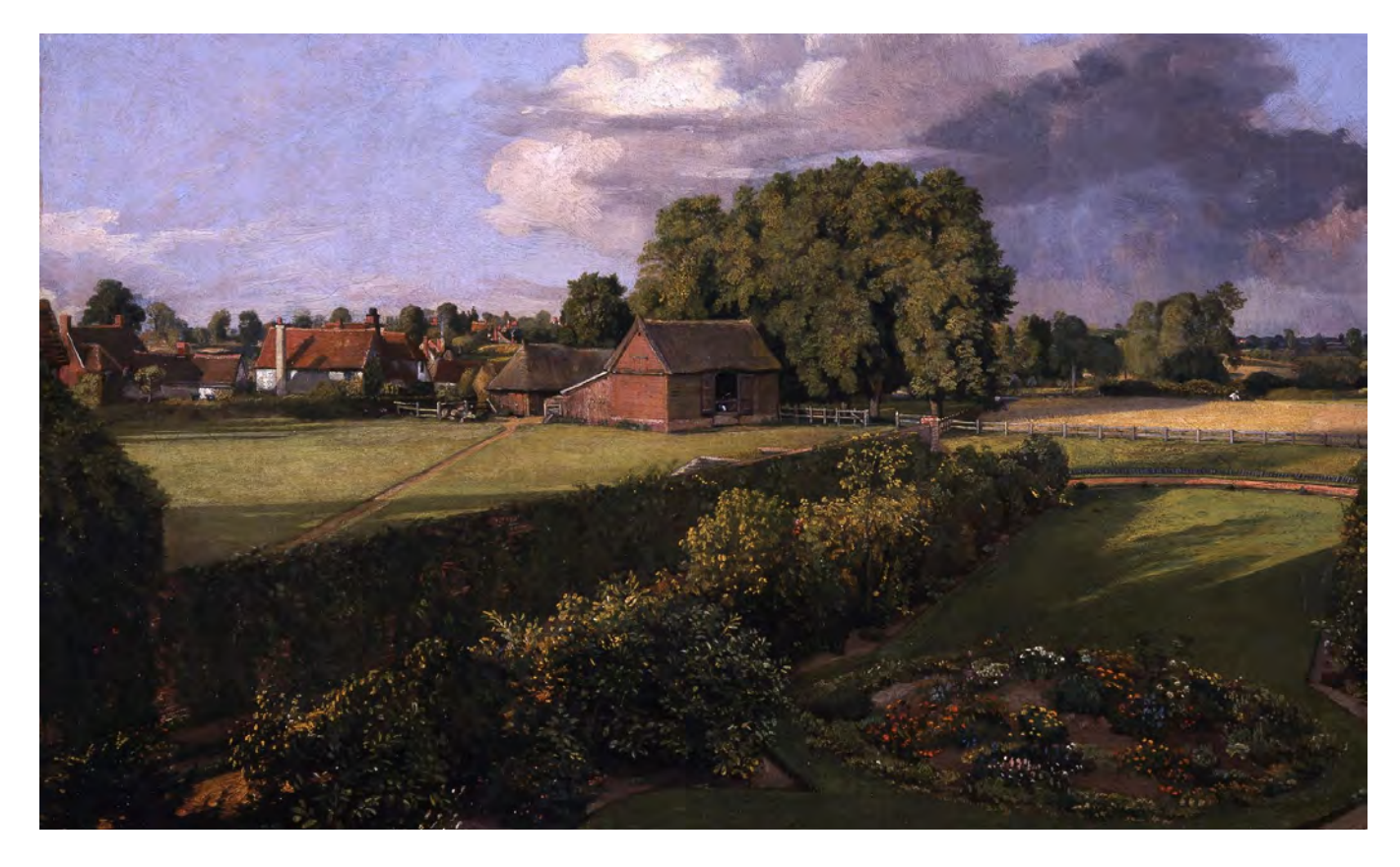
Golding Constable's Flower Garden, oil on canvas, 1812-16, 13x20 inches, Ipswich