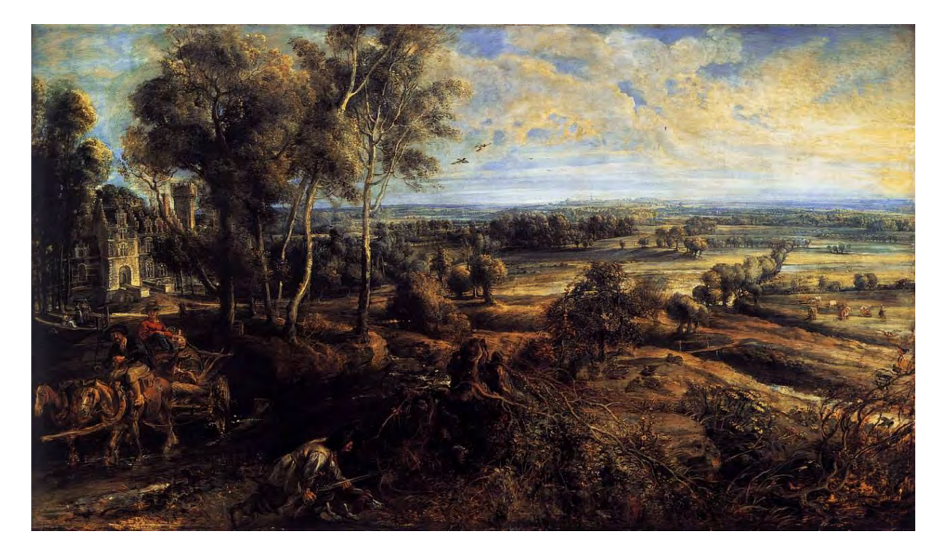
Autumn Landscape Het Steen, 1635, oil on panel, 54x93 inches, Peter Paul Rubens, N.G. London