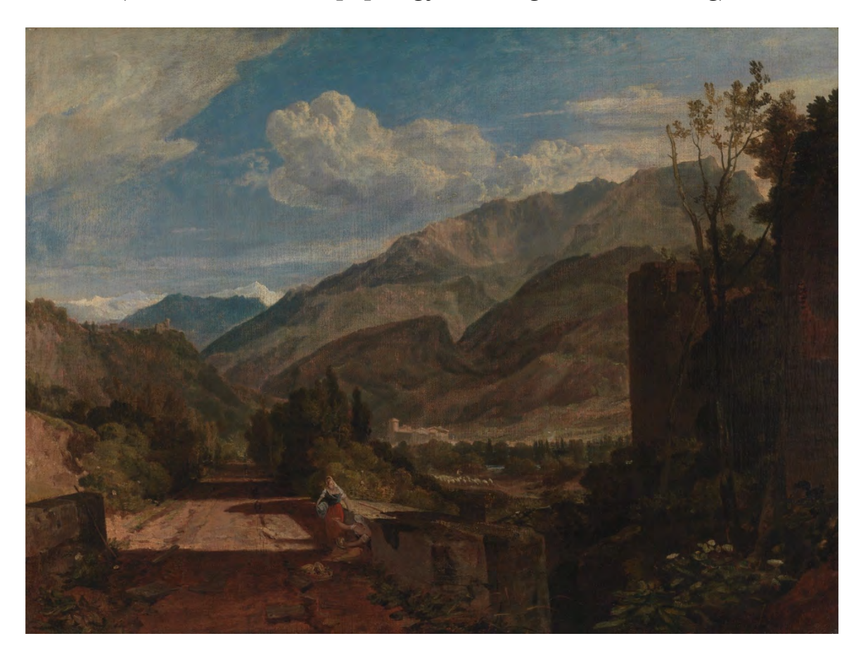
Chateaux de St Michael, Bonneville, Savoy. 1803, oil on canvas, 36x48 inches Yale Centre for British Art

As with Fishermen at Sea , his first major oil painting of the sea, Turner has demonstrated his ability to portray the Sublime nature of the windswept scene, with ominous rainclouds overhead and a churning