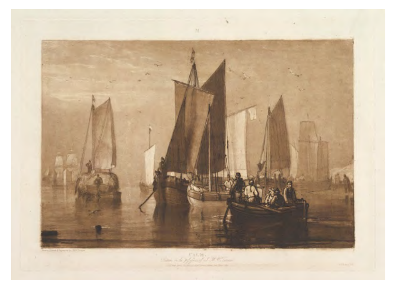
The Calm, 1807, etching, aquatint and mezzoprint, J.M.W. Turner & Charles Turner