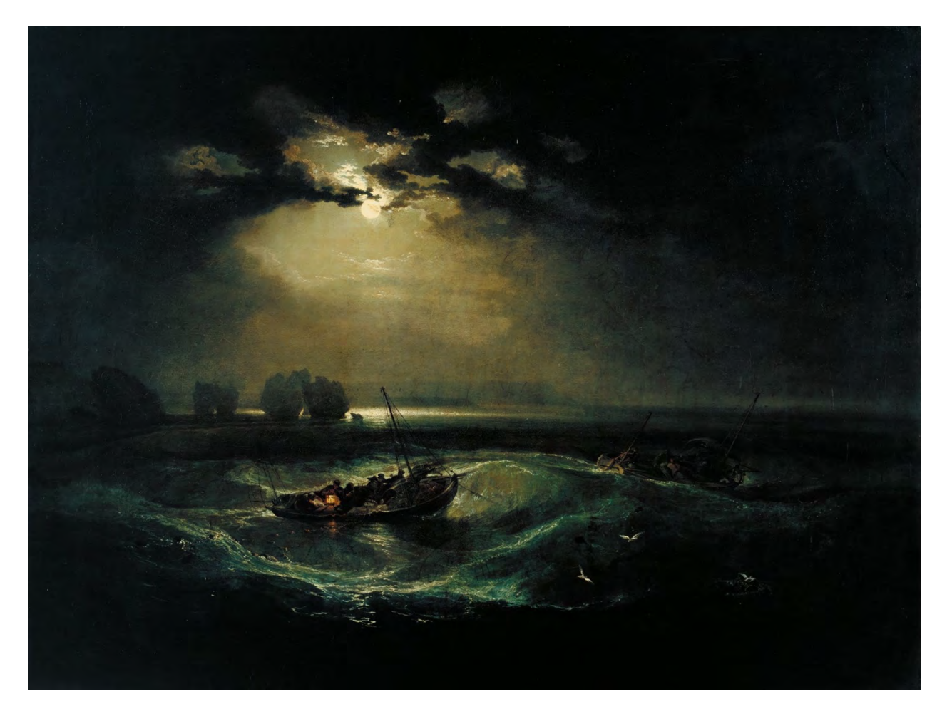
Fishermen at Sea, The Cholmeley Sea Piece, 1796, oil on canvas, 36x48 inches, Tate Britain