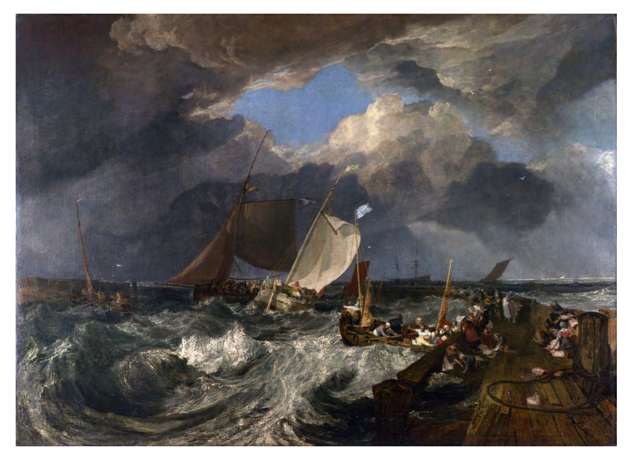
Calais Pier, with French Poissards preparing for Sea: English Packet Arriving, 1803, oil on canvas, N.G.