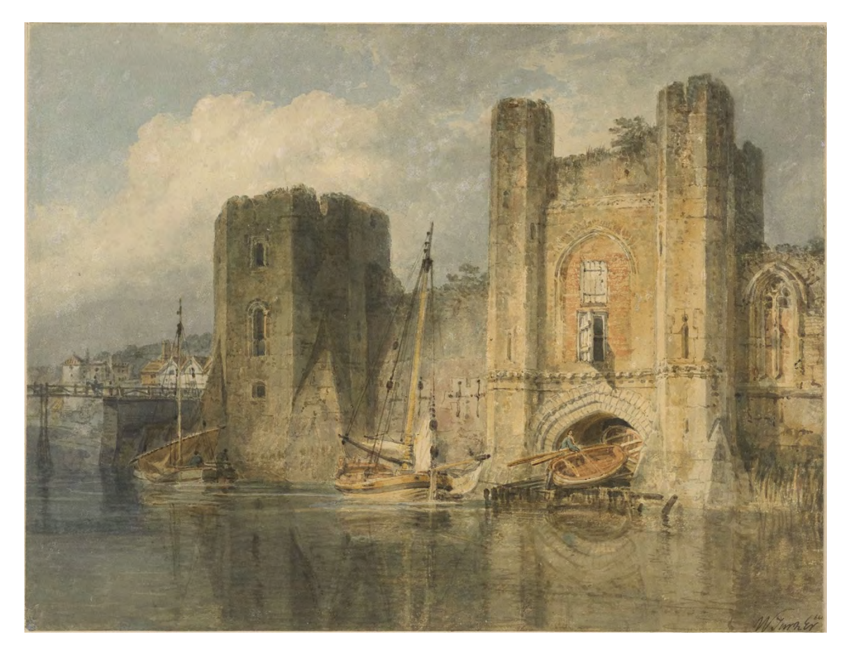
Newport Castle, pencil and watercolour, 1796, British Museum