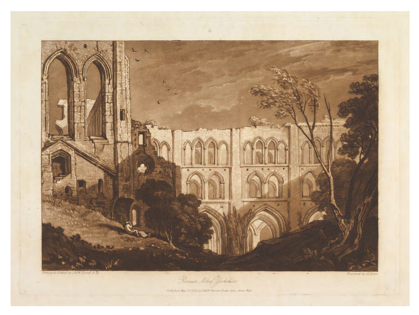
Rivaux Abbey , 1812, etching and mezzoprint, J.M.J. Turner & Henry Dawes

The Calm, was undoubtedly based on one of the many Dutch 17<sup>th</sup> century marine paintings by both William van de Velde and Jan van de Cappelle, the two greatest exponents of serene seascapes, many of which were to be found in aristocratic collections, or alternatively he may have just seen a print, which were also widely available. Whilst a small painting, Dutch Ships in a Calm Sea, is quite justly one of the most renowned of such themes.