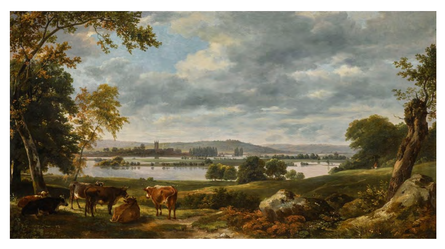
Dedham Vale with the River Stour in Flood, 1814-17, oil on canvas, 22x39 inches, Private

The painting appears to have been commenced en plein air, before completion in the studio. It's a painting much influenced by Aelbert Cuyp, whose bucolic cattle scenes were very popular amongst the English aristocracy; certainly one of Constable's most successful paintings to date.