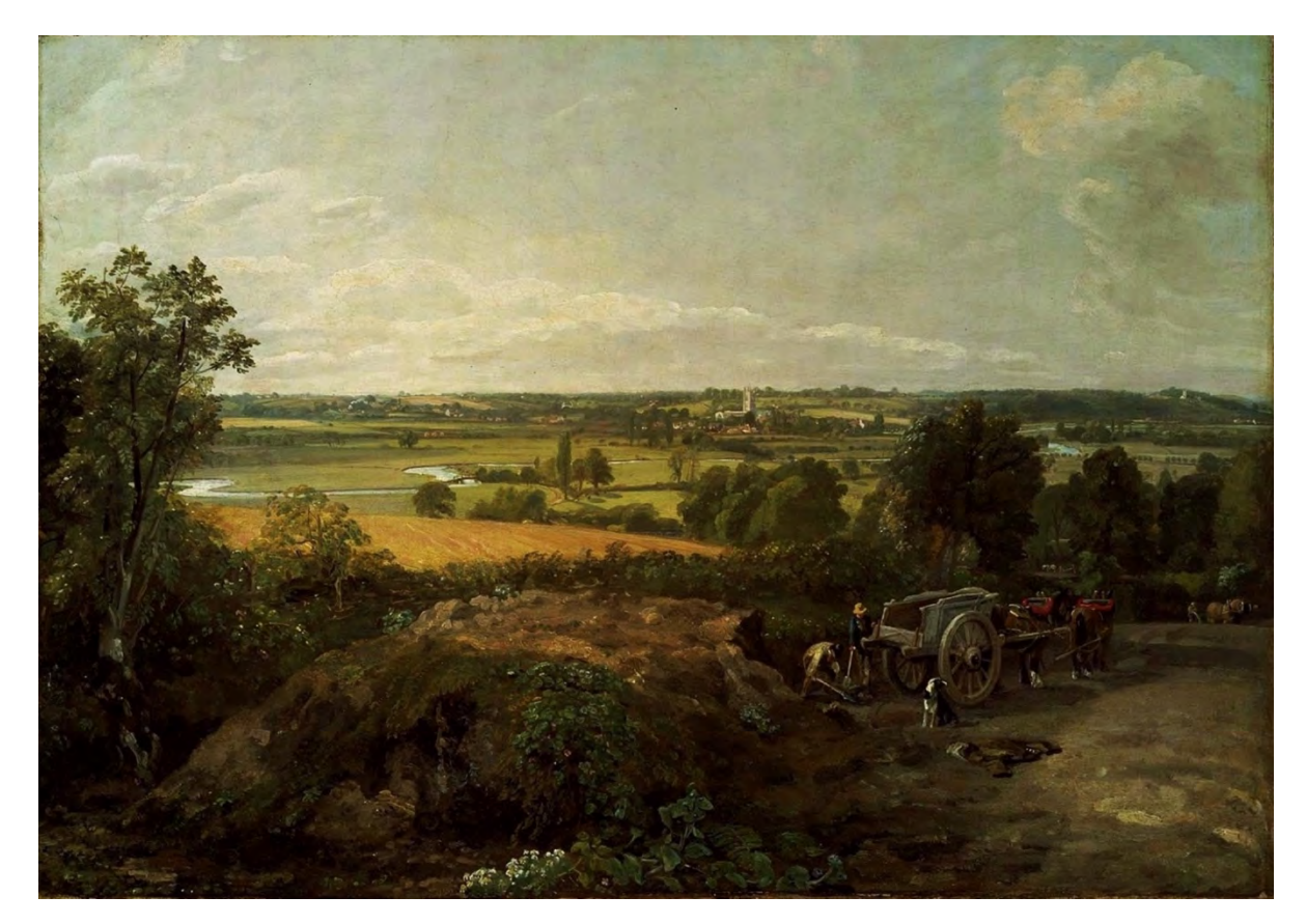
The Stour Valley and Dedham Church, 1814, oil on canvas, 22x30 inches, 1814, Boston

Constable was unique for his time, in that he wished only to record faithfully the countryside closely surrounding his rural haven. However, this is a cleaned up and beautified, but nevertheless rustic landscape, undisturbed by evidence of rural poverty and social unrest. It is a landscape of nostalgia, for a time that was only in the minds of those like Constable, whose lives were comfortable, who either did not recognise the plight of the poor, or who chose to ignore it. In the early 19<sup>th</sup> century at the Academy, such landscape painting was still deemed prosaic and not sufficiently intellectually elevated.