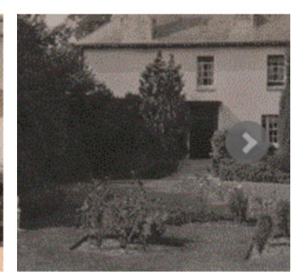
Here is a great collection of historical local pictures - The collection continues to grow. Please send us your pictures